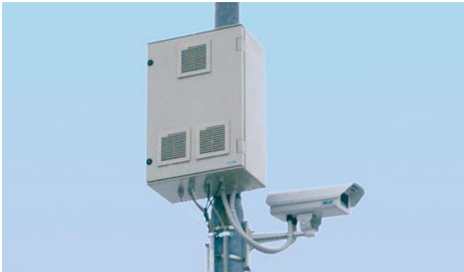
WebCCTV Outdoor* *Camera is not included

Most standards-based network video recorder for outdoor use