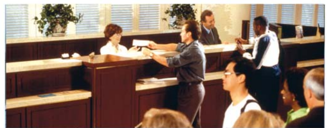
Banking and Finance