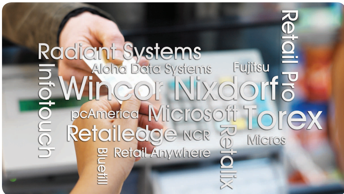
QPOS Link supports POS systems of these manufacturers but not limited to

POS and Video Surveillance Data Synchronised