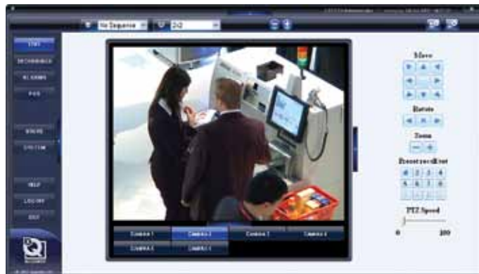
GuardNVR User Interface

Using IT-standards considerably reduces the total cost of ownership of various industry solutions. It allows interoperability with other systems and gives freedom to choose hardware and software suppliers for future purchases. The ability to “play the market” gives power to the customer and eliminates dependency upon the supplier.